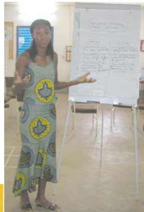
Training of b|u|s trainers in Gaoua, BF

The target groups for b|u|s entrepreneurship training comprise all relevant actors: First of all, farmers and other rural business people who face problems with regard to their integration into the market economy and to making use of new opportunities; management and staff of economic entities along the entire value chain (traders, processors, service providers, exporters etc.) for more effective exchange and governance within the value chain; in addition, the b|u|s training enables representatives from public bodies to better support target groups from their position and to establish appropriate framework conditions.