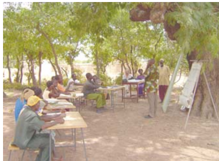
BUS-Training in the region of Diébougou, Burkina Faso

Agriculture and all related activities within different value chains represent a very big potential for Burkina Faso. It occupies 90% of the active population and produces 70% of the country's export goods: cotton, groundnuts, sesame and animals. In general, agricultural production is stable but not very effective. The agricultural sector is characterised by low productivity, lack of investments, difficult access to markets, deficits in information and difficult access to credit.