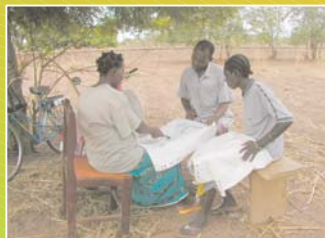
Focus on communication